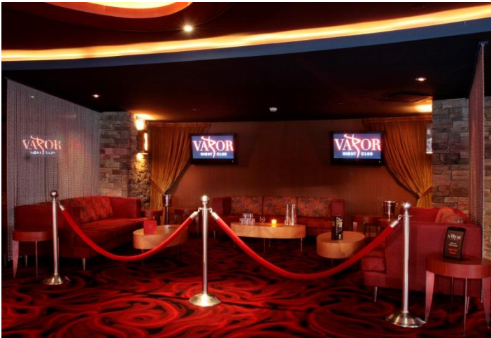
Lounge 2 & 3