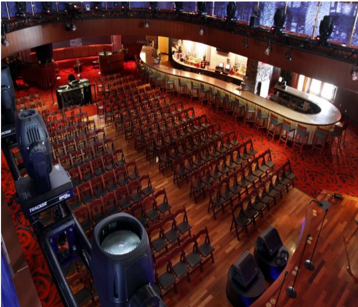
Main Floor Theater Style